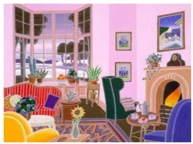
"Concord" © 2020 by Thomas McKnight, all rights reserved