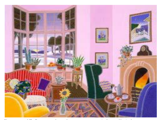
"Concord" © 2020 by Thomas McKnight, all rights reserved