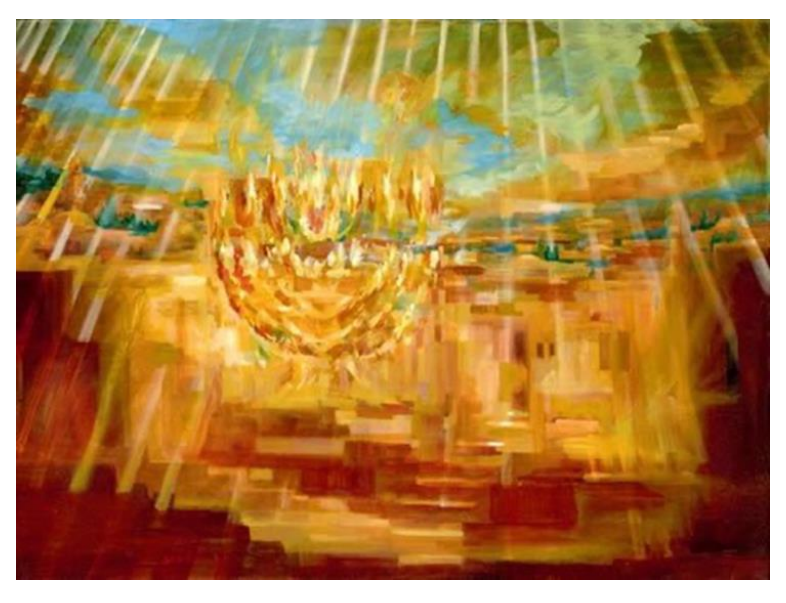
Jerusalem Menorah by Yoram Raanan

"When the holy Temple stood, the light of the menorah (a visible sign of the supernatural light of the Shechinah) emanated from the windows which were uniquely constructed to let light out, rather than in. It illuminated not only the Temple courtyard, but all of Jerusalem. To complete the picture of Jerusalem, there needed to be light in the middle of the scene, the golden light of healing and fellowship and true peace, which we pray will shine again soon from the heart of Jerusalem." Yoram Raanan