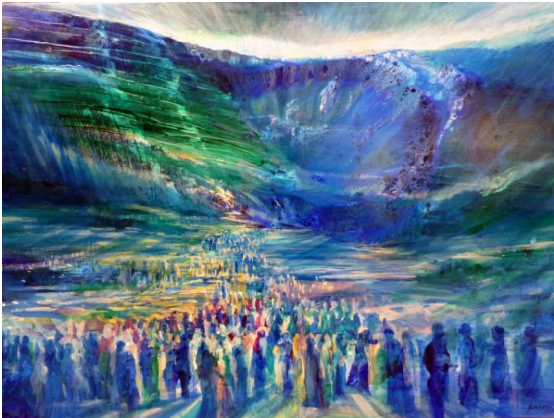
“Crossing the Red Sea” by Israeli artist Yorem Raanan