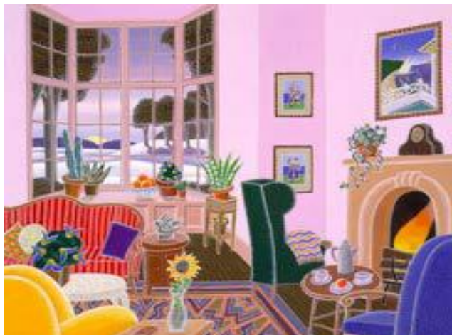
"Concord" © 2020 by Thomas McKnight, all rights reserved