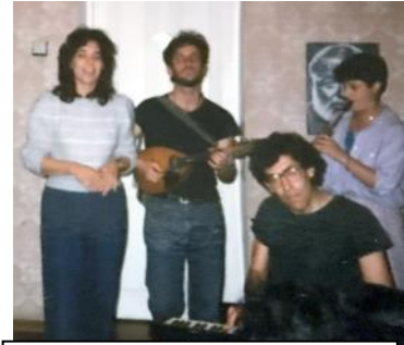
Our four speakers on their mission in the USSR

Sunday, Oct 16 10:30am – 12:00pm Location: Zoom